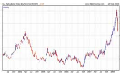
DJ Agriculture Index

Charles Vilgrain , AgroGeneration, France / Ukraine