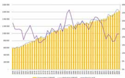
Grain stock to use

— Consumption (1000 MT) — Production (1000 MT) — Stock to use %